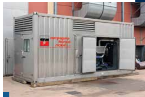
V.500 - 20' - 55 dB(A) @ 7m - AISI 316L