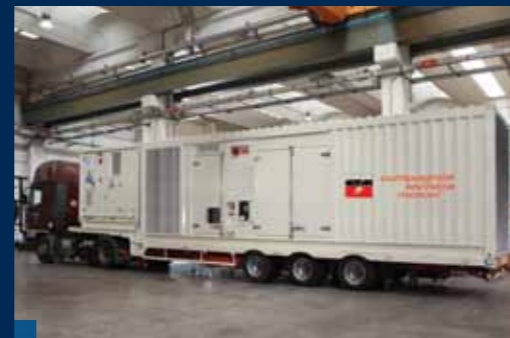
M.1900 - Trailer Cont. - 70 dB(A) @ 7m