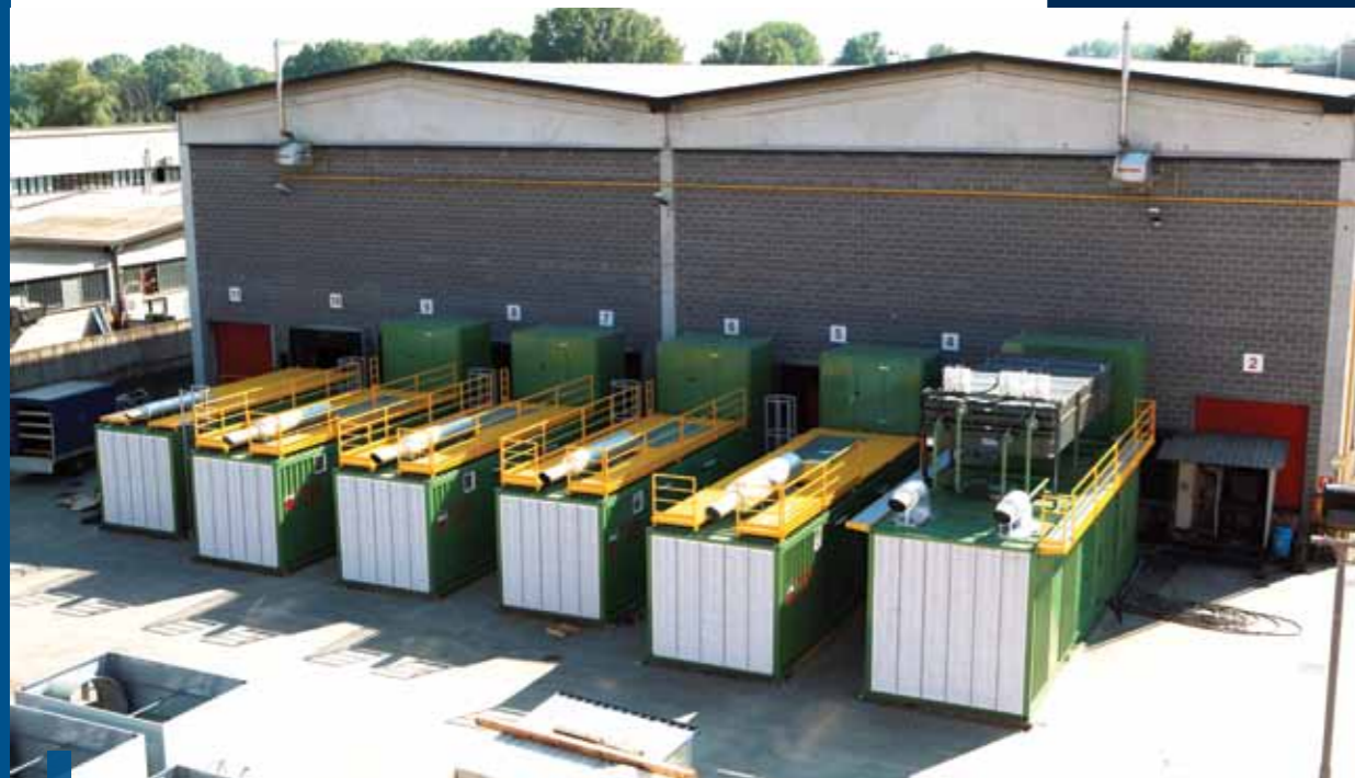
Generating Sets – MTU Powered in 40' – 85 dB(A) @ 1m