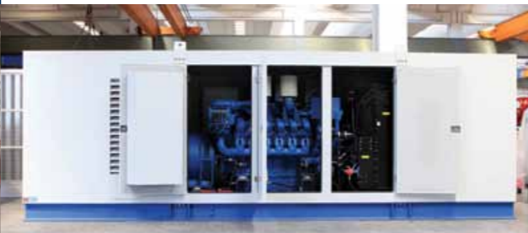
MT.1400 - 85 dB(A) @ 1m