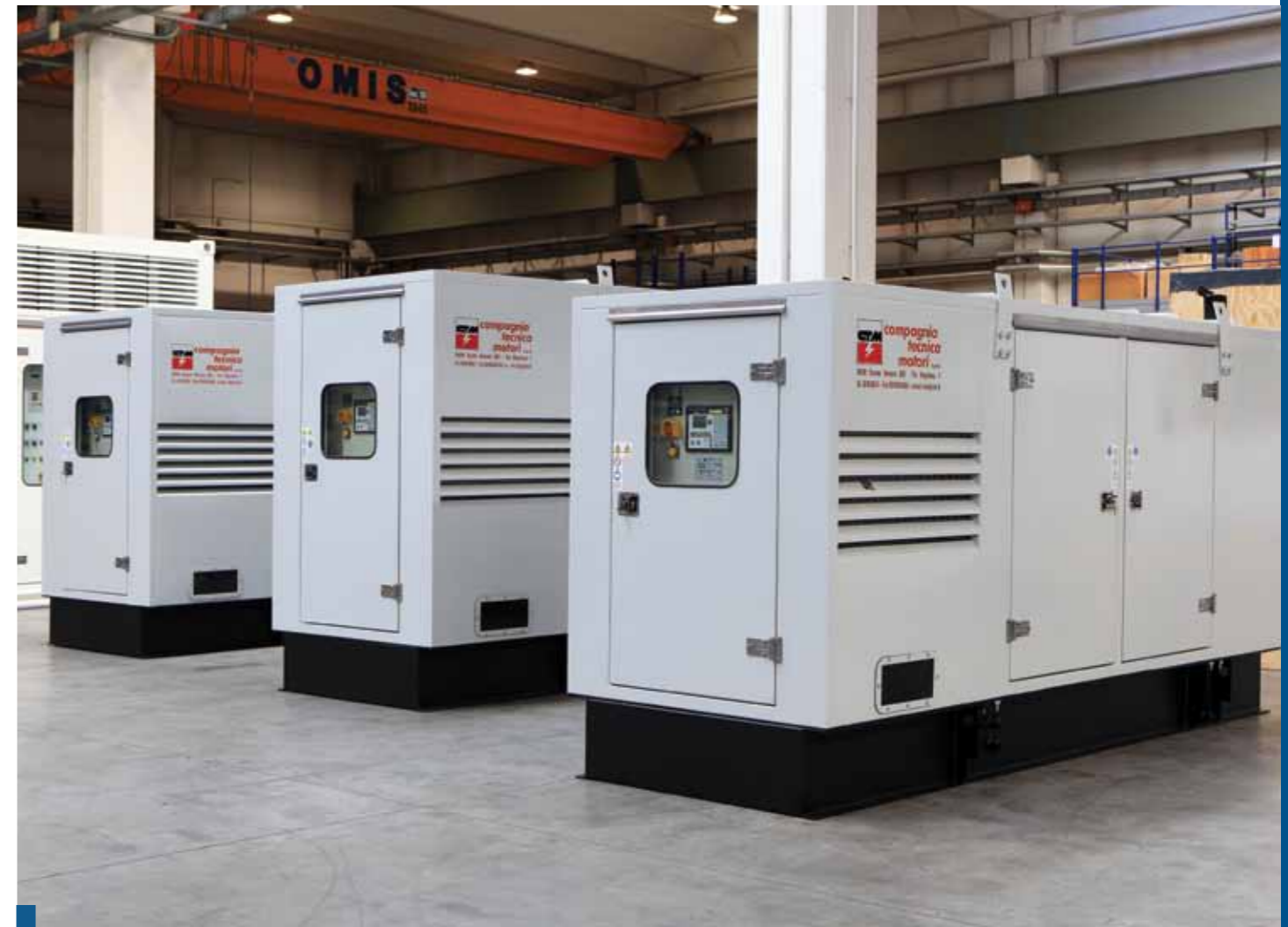
P100 - 85 dB(A) @ 1m

The canopies provide high noise attenuation and are self-supporting structures of monobloc type, able to ensure the lifting of the entire Diesel Generator. The canopies are complete with double doors to allow easy maintenance of the Generator Set and are complete with a separate compartment for the control panel of the Generator.