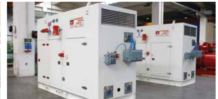
P100 - 85 dB(A) @ 1m - AISI 316L